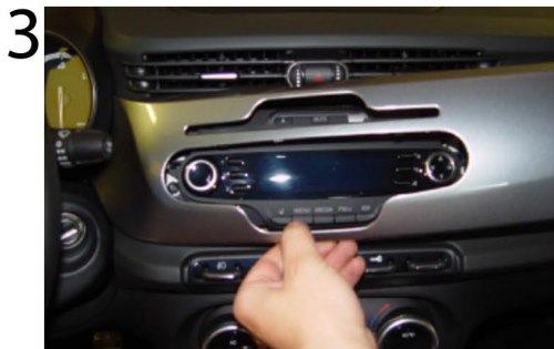
Unclip the trim frame surrounding the OEM head unit and remove it