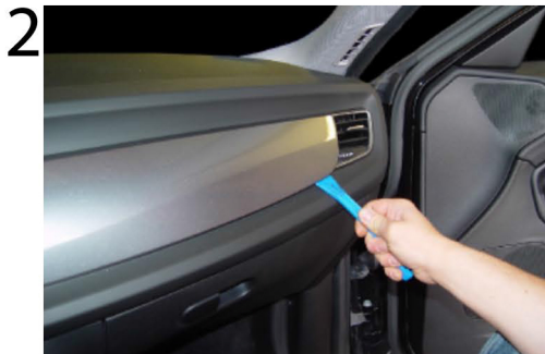
Remove the original panel starting at position shown