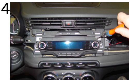
Use a screwdriver to remove screws from the original car-radio