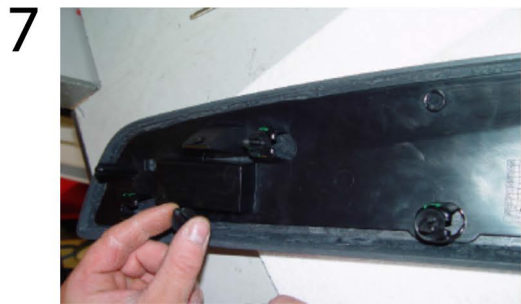
Insert the snap fastener to the radio frame supplied with the kit