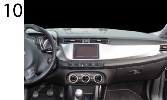
Clip the fascia into place. Installation is now complete