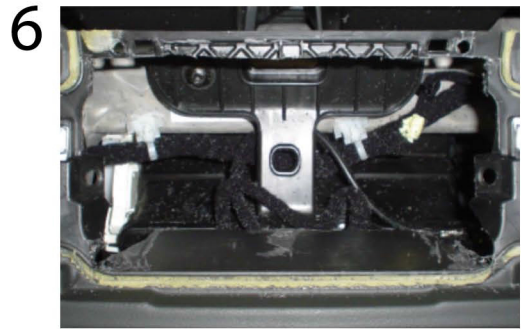
This is the result after cutting the plastic frame