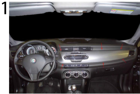
Connection points radio frame / Dashboard