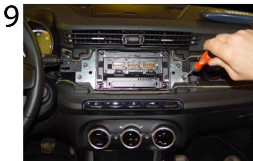
Connect all the cables then mount the radio and screw it into place